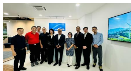
Delegated at the SAG Meeting - Nov. 26 th , 2025