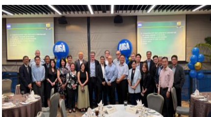
Delegated at Award Event 2025 - Nov. 25 th , 2025