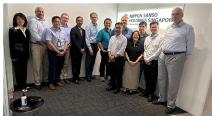
Delegated at the 70 th Meeting of AIGA TC- Nov.24, 2025

In addition, AIGA VN discussed its needs for technical support for the 2026 work plan, including document sharing and the provision of experts for the “ASU Operation and Maintenance Safety” project and the “Hydrogen Safety National Regulation” project.