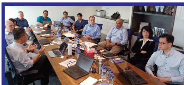
Delegates at the 70 th Meeting of AIGA Technical Committee

70 th meeting of AIGA TC was held in person on 24 Nov 2025 in Singapore. AIGA thanks Nippon Sanso (NSHS) Office for sponsoring the meeting venue. Secretary Generals of AIGA China and AIGA Vietnam Representative offices joined the meeting as special invitee who presented the progress made by their respective offices with regards to promoting safety and AIGA publications in the respective countries. TC Members reviewed the progress with the activities of Work Groups, how to promote safety in H2 mobility & clean energy and progress with publications work in 2025.