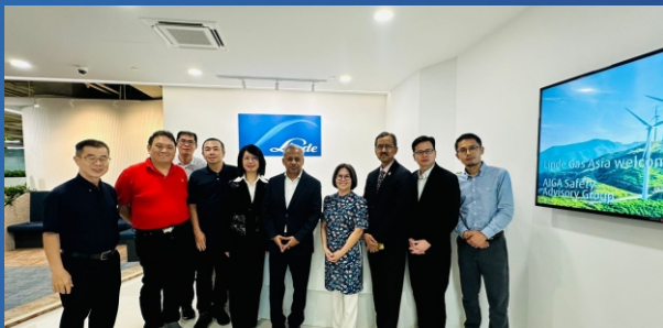
Delegates at SAG meeting on 26 Nov 2025

AIGA Safety Advisory Group held their face-to-face meeting on 26 Nov 2025 in Singapore. AIGA thanks the Office of Linde Plc located at Pacific Tech Centre for sponsoring the meeting venue. The meeting was attended by all SAG members and Secretary Generals of AIGA China and AIGA Vietnam Representative offices. SAG members reviewed the Key safety KPIs of all member companies, Transport Safety Dashboard, Learning from accidents & incidents in 3Q 2025 and also reviewed drafting of publications on hand.