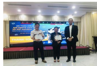
Present Cert. of Appreciation to Speakers