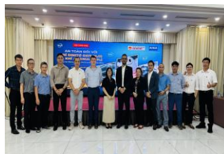
AIGA VN team