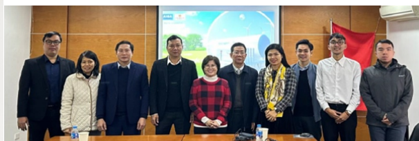
Delegates at the kick-off Meeting on 30 Jan 2024

- AIGA in cooperation with VINACHEMIA has initiated a project on drafting of "National Technical Regulation on safety in production, filling, storage, transportation and use of Hydrogen". A kick-off meeting took place to initiate the project at the office of the Center for Chemical accident Response and Safety under the VINACHEMIA - Ministry of Industry and Trade in Hanoi on January 30, 2024.