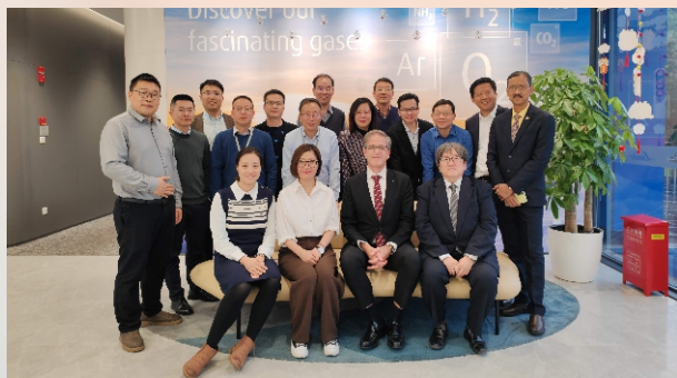
AIGA Board President with TC members