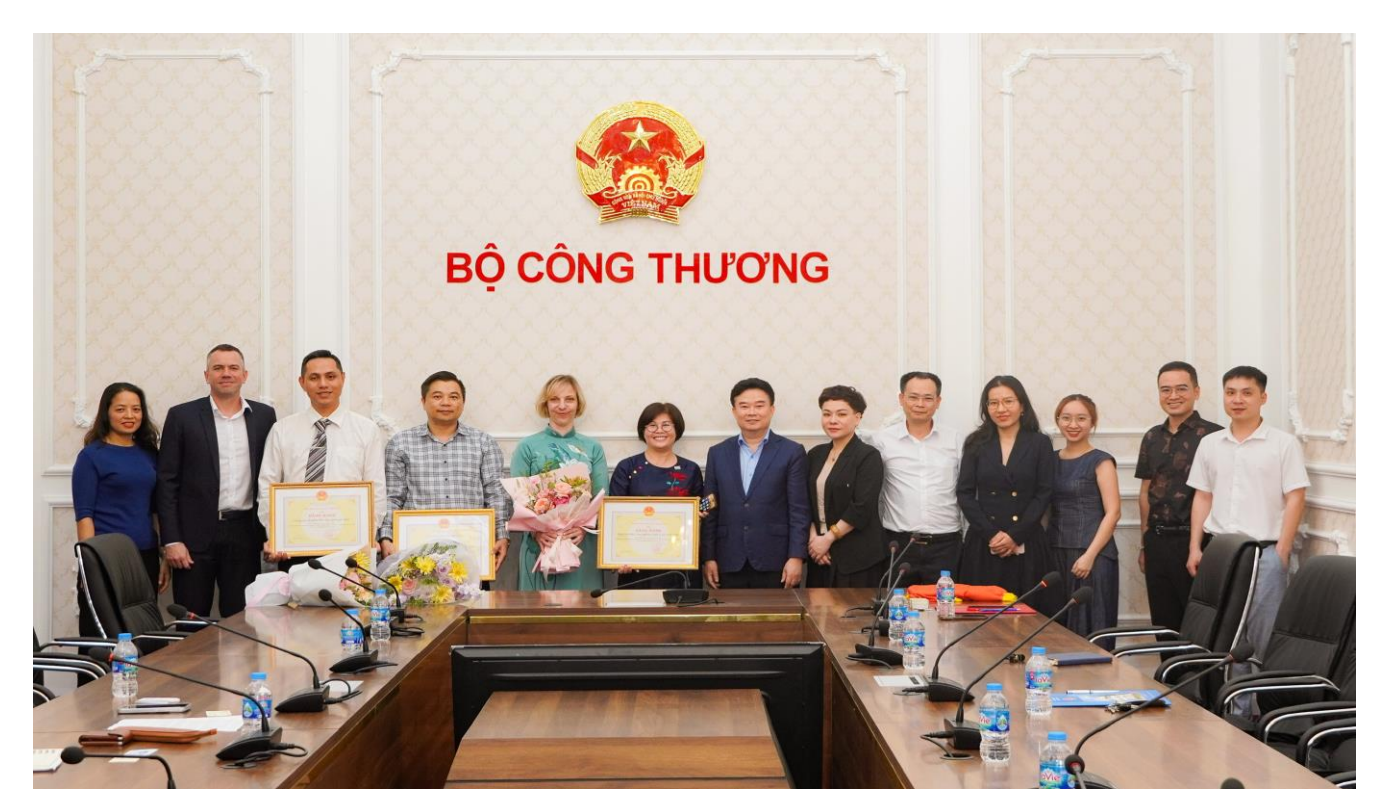
Delegation present at the ceremony

Representatives from the two units Sovigaz and Thanhgas were also present at the ceremony to receive their certificate of merit.