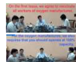
JUL 17, 2021