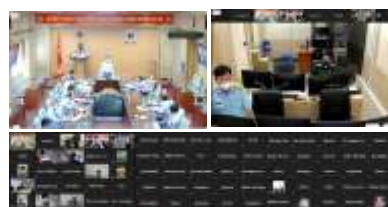
AUG 21, 2021