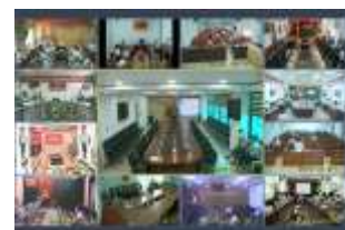
SEP 13, 2021