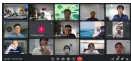
JUL 23, 2021